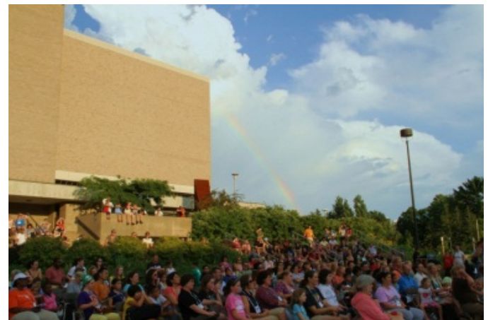
ASI 2011 Welcome Ceremony Rainbow